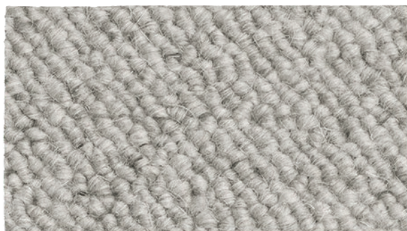
Nimbus Cloud 174