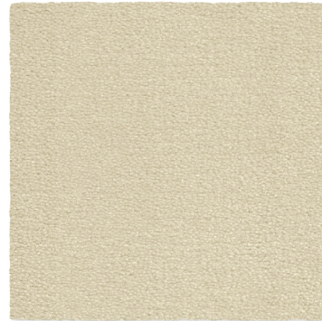
023 Light collection